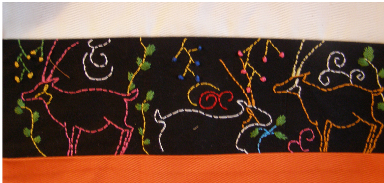
Arabian Oryx – The embroidered Motif

We have 3 different motifs finished and two more that we are working on. The completed motifs are: