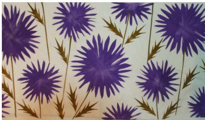
Purple Thistle of Jordan (revised motif)