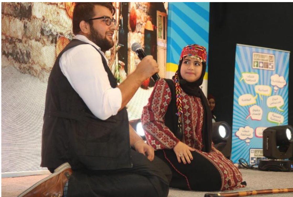
Bent 15 campaign from Yarmouk University presenting their campaigns achievements through a skit.