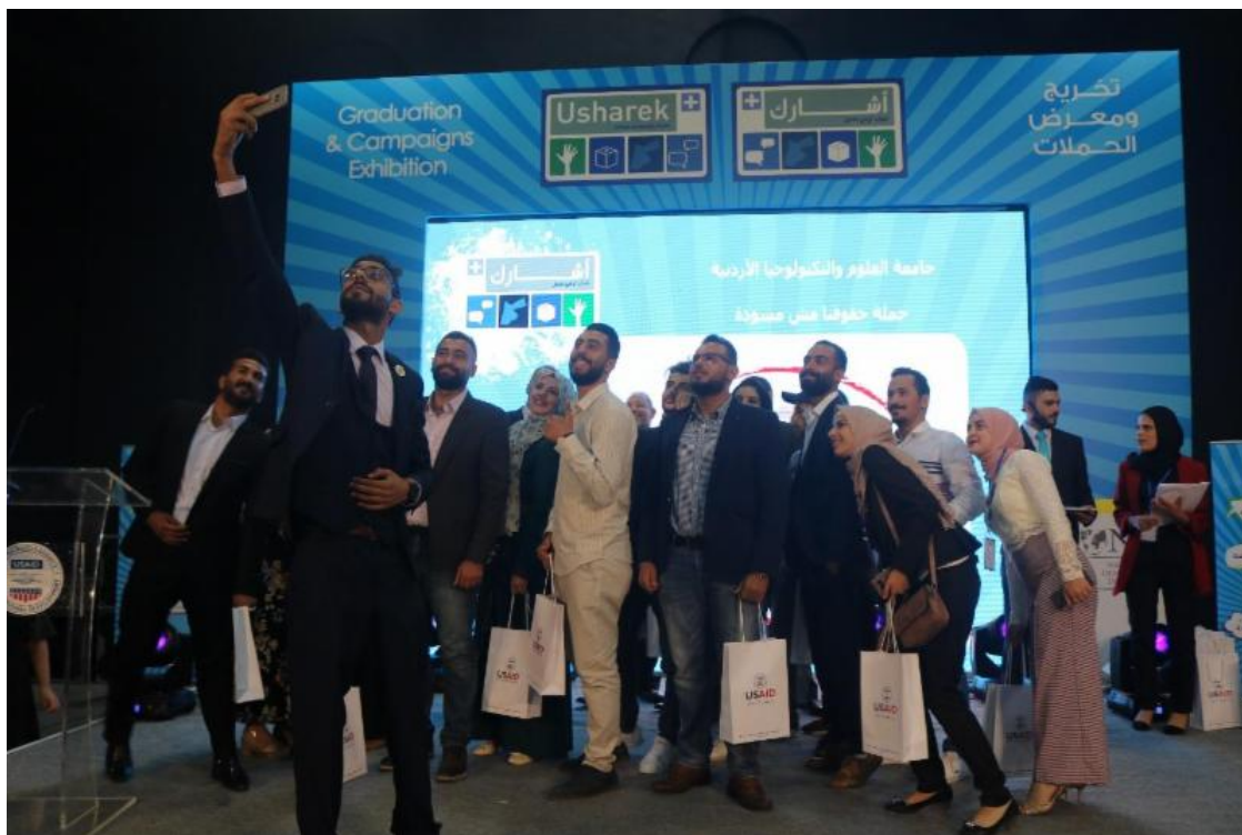
Usharek+ graduates after receiving their certificates on stage.

Before the graduation ceremony, guests had an opportunity to tour the exhibitions, view some of the best photos taken throughout the year, and discuss campaigns with the students. Across the participating universities, students formed 27 campaigns over the course of the 2017-2018 academic year on issues including assistance to marginalized communities, improving the lives of women and girls, increasing opportunities for youth representation in government, and environmental rehabilitation. Many graduates worked directly with elected officials or members of government to achieve their goal, while others built coalitions with international or Jordanian civil society organizations. Representatives of many of those groups were present to take part in the graduation and exhibition.