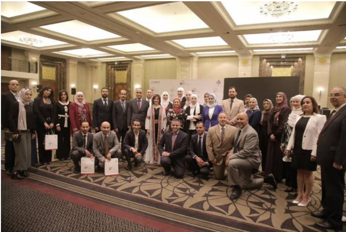
Public sector participants at the launching ceremony of the Government Leadership Program

At the beginning of 2018, the Government of Jordan set out to develop the Government Leadership Program, a national priority declared by H.M. King Abdullah, to be the primary training program delivered to potential leaders in the public sector. The Institute of Public Administration developed the program in cooperation with USAID Rule of Law Program.