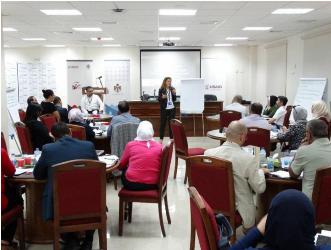
Participants receiving theoretical training during the first phase of the Government Leadership Program

The program works with decision-makers in the public sector, develops strong relationships between those in the program, and provides post-training mentorship and support from private and public sector leaders.