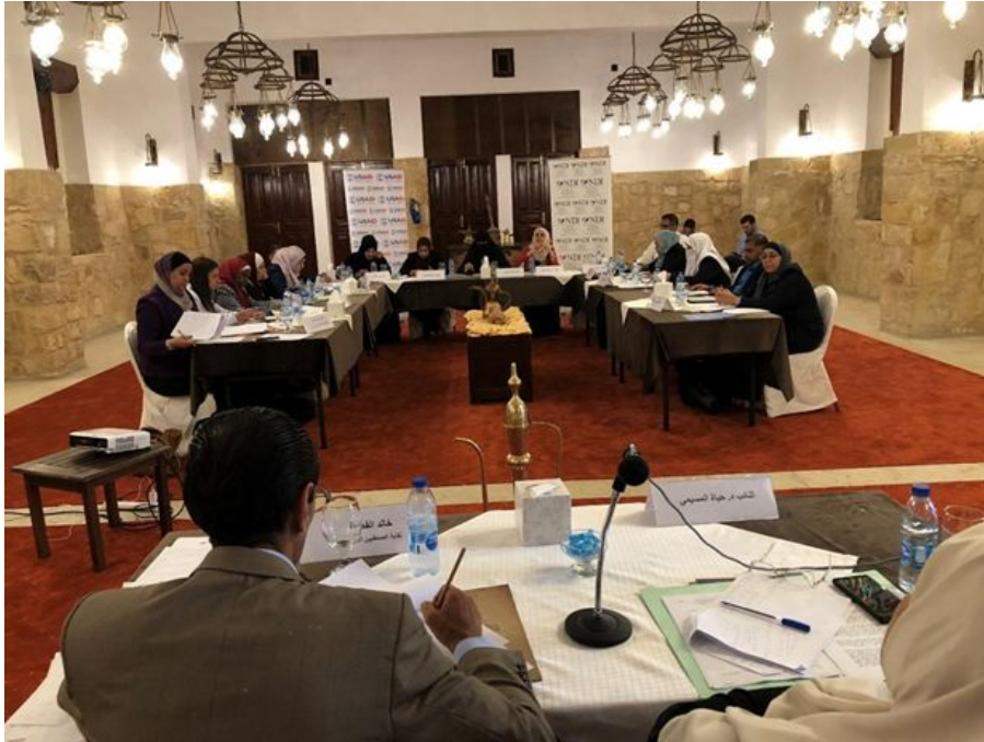
Members of the Parliamentary Women Caucus during the workshop on Cybercrime Law

On October 18, NDI's Women Political Participation Program held a two day workshop for 12 members of the Parliamentary Women Caucus in the city of Petra to discuss the proposed amendments to the Cybercrime law and widen the Women MPs' exposure to different opinions. The workshop also included a training on debate skills as requested by women parliamentarians.