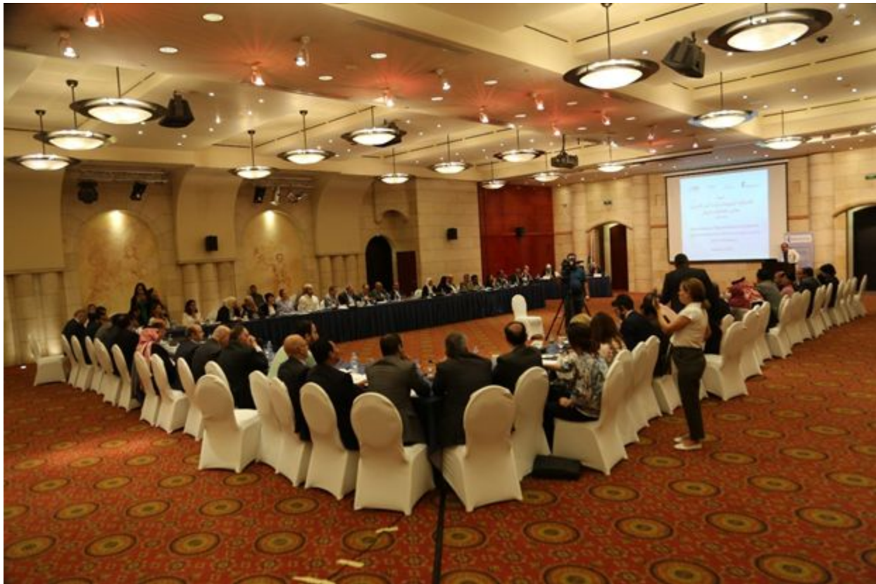
Participants during Al Quds Center for Political Studies workshop on decentralization

On September 24, NDI's CSO Partner Al Quds Center for Political Studies held a workshop titled "Decentralization: Responsibilities and Mechanism of Partnership between the Governorate Councils and Parliament" in Amman to discuss the policy paper issued earlier by Al Quds Center on "New Mechanisms to involve Parliament and the Newly Elected Governorate Councils in the State Budget Cycle". The workshop opened a discussion between members of the House of Representatives and members of the governorate councils and saw the attendance of 90 participants including 15 MPs.