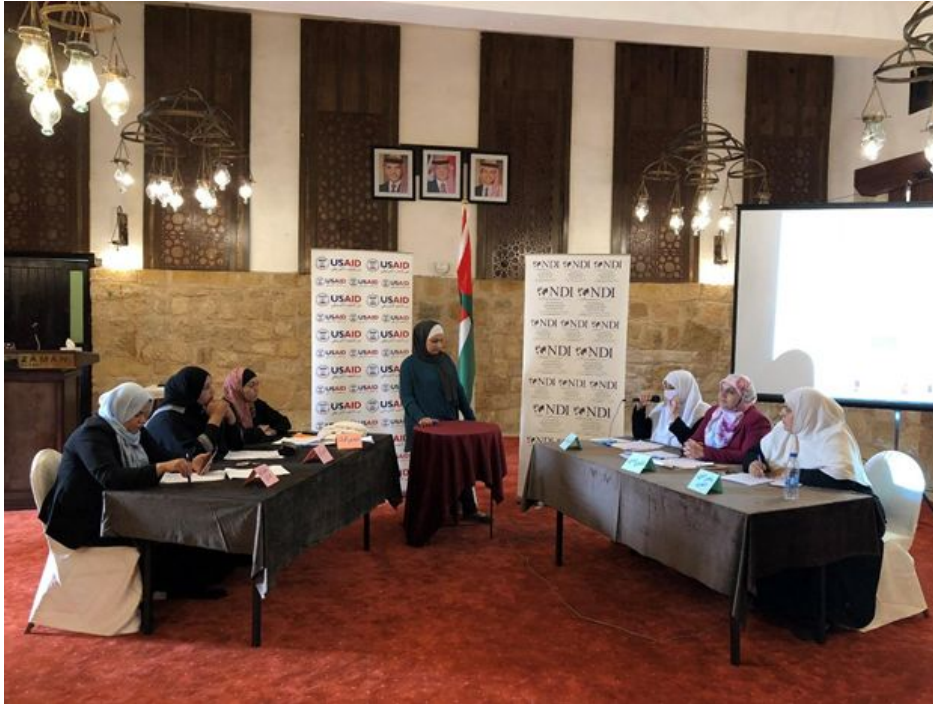
Members of the Parliamentary Women Caucus during the training on debate skills