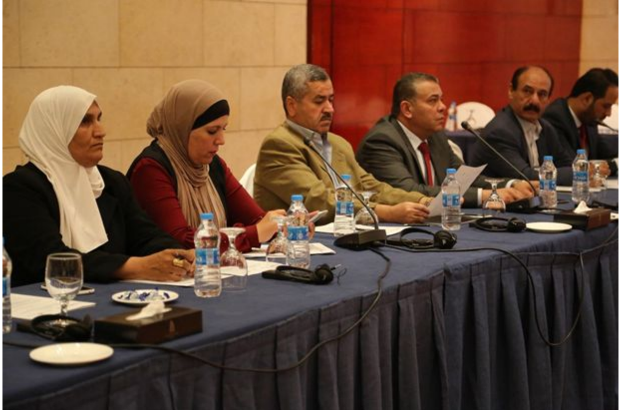
Participants during Al Quds Center for Political Studies workshop on decentralization

The second session was devoted to the opinion of a number of presidents and members of the Governorate Council, followed by a discussion with the attendees. This workshop discussed the responsibilities of the Governorate Councils in relation to their approval of the state budget cycle and also the role of the House of Representatives in approving the budget of the governorates.