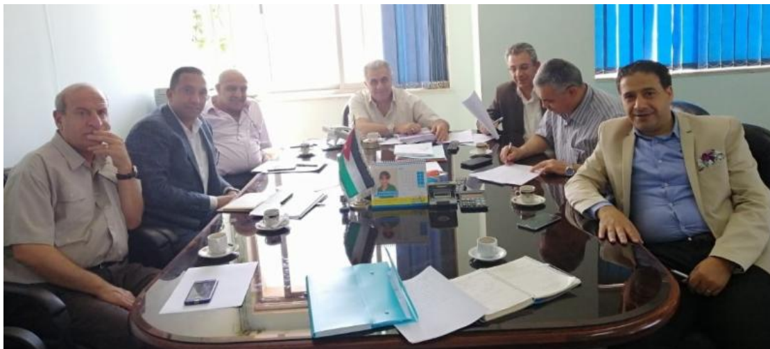
HFG staff with MOH budget and maintenance staff in a meeting to review health governorate budgets for 2019.

In September 2018 and as a result of HFG interventions, the GOJ increased the amount allocated to health by 23% to JOD34.6 million. These funds represent the result of improved planning and identification of governorate needs in line with the MOH decentralization initiatives.