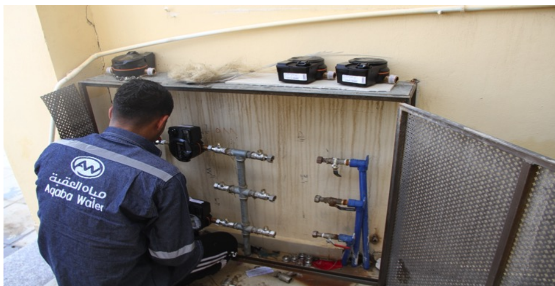
Mechanical residential water meters alongside more accurate ultrasonic meters.

water reduction needs to be different there than in other parts of Jordan. As part of the USAID Non-Revenue Water Project, the Management Engineering Services Contract assisted the Aqaba Water Company in replacing 7,250 mechanical residential water meters with more accurate ultrasonic meters. In addition to the new meters, a communications network and data management systems were installed, enabling two-way communication between the utility and its customers. It was anticipated that ultrasonic meters may have a bigger benefit in Aqaba than in places that have an intermittent water supply because the average flow rate through the customers' meters is much lower than with intermittent supply.