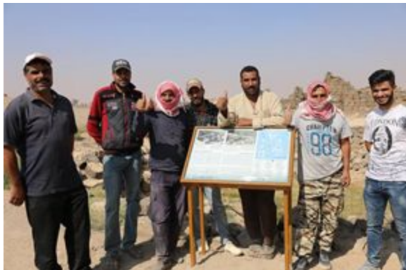
Labors during installing signs

SCHEP endeavors to make heritage understandable and accessible for all. To this end, SCHEP installed 33 bilingual signs Umm al Jimal to explain the unique and living history of the site. Not only does this allow both international and Jordanian visitors to get more out of their experience at Umm al Jimal, but it is also an important step towards getting Umm al Jimal added to the World Heritage List.