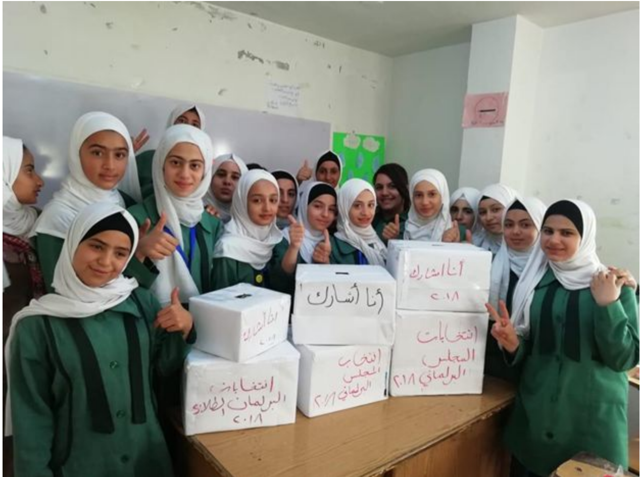
Students from Hay Sikareen School for Girls in Ajloun preparing for the students Parliament elections

The elections lesson in Ana Usharek-Schools program's curriculum was given great importance this month as it goes parallel with the elections of the Student Parliament at schools.