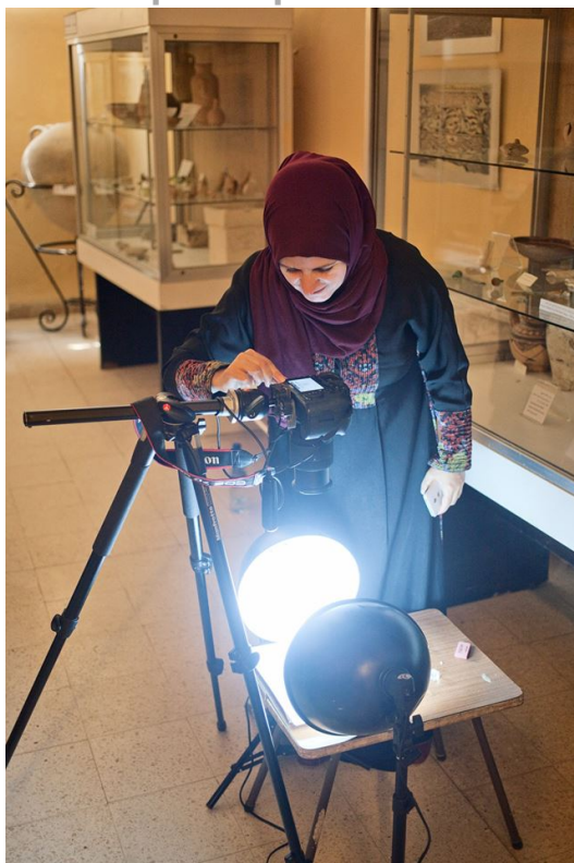
Participants practiced their new skills at the Madaba Regional Archaeological

This month SCHEP hosted two training workshops for museum employees. The first took place in Madaba and trained participants in artifact photography.