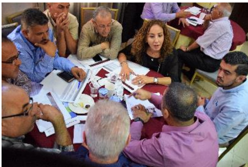
Managers at Yarmouk Water Company discussing action plans as part of Business Plan preparation 2019-2021.

The Yarmouk Water Company, supported by the USAID's Water Management Initiative Project, conducted a working session from October 1 to 2, 2018, to reflect on the multiple strategic planning interventions that were implemented.