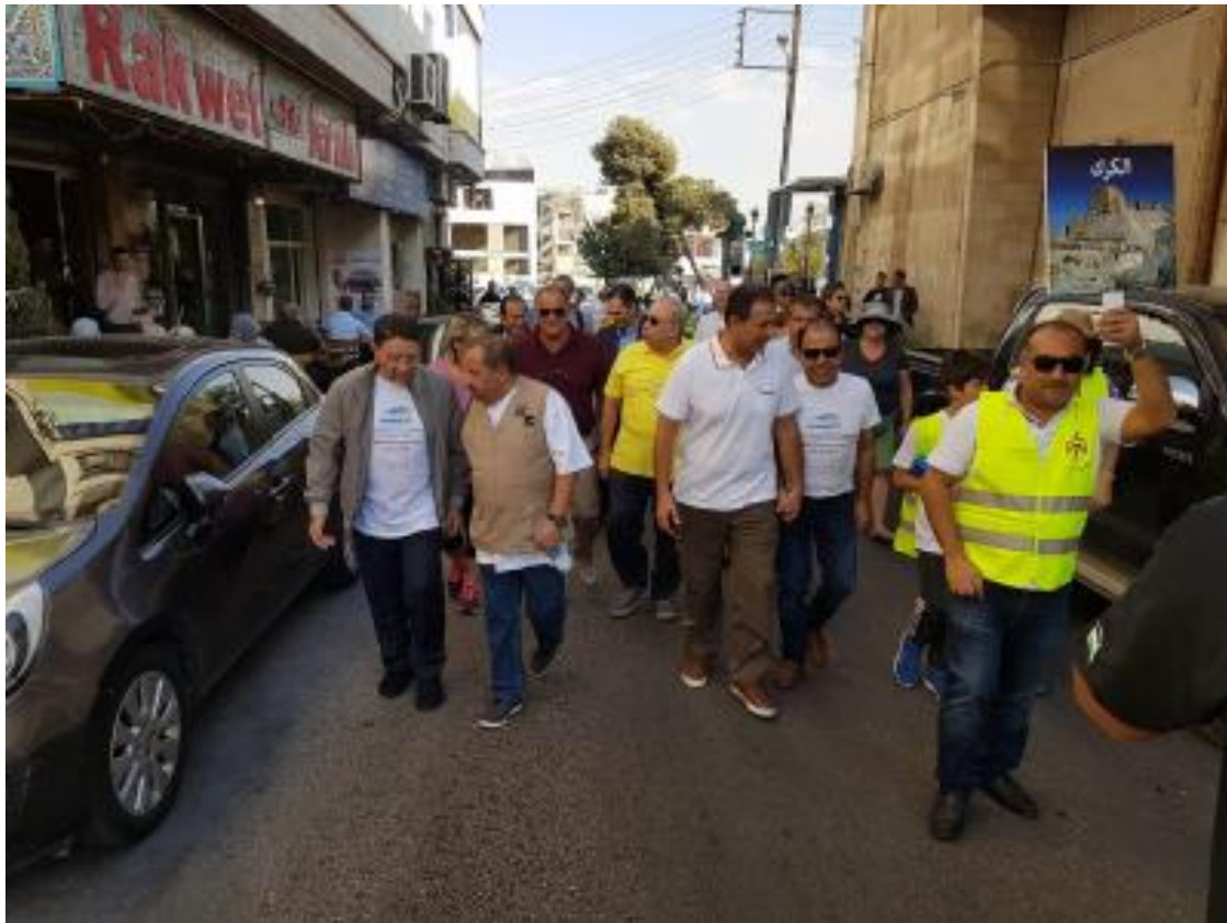
World Tourism Day participants walk and talk en route to Abdali Boulevard.