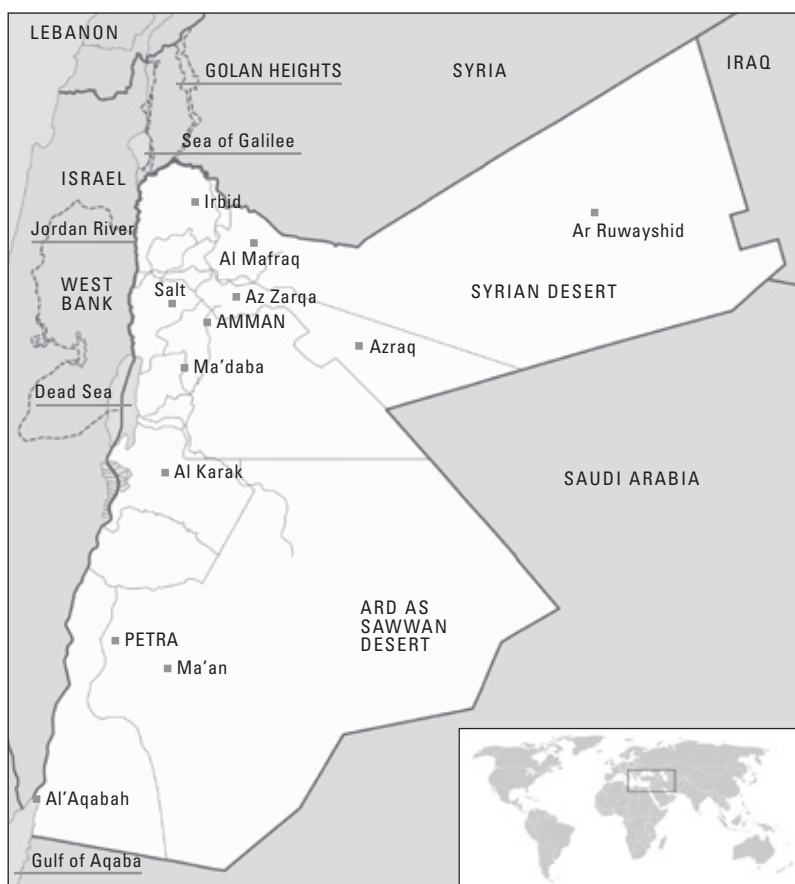
Map 1 Jordan's location