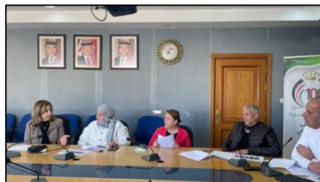
Snapshot from the ESMP-facilitated Meeting between MoE, MPWH and DLS

In Jordan, one of the issues that the public education sector suffers from is land management. Whether it is the lack of land-related data or the lack of land plots altogether, this hinders the ways in which the government seeks to improve public infrastructural services. Land-related data is critical for governmental planning as it provides valuable insights that aid decision-making processes. Accurate and up-to-date land-related data helps governments to identify suitable land for various purposes. It also enables tracking land patterns and changes over time and to align existing land resources with the different demand variables in each area.