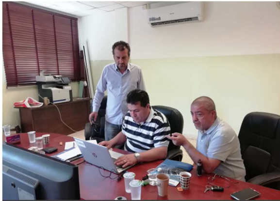
Practical coaching session in Aqaba Water Company.