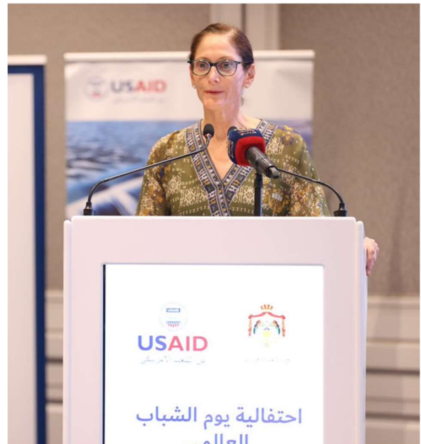
USAID Mission Director delivering her remarks at the International Youth Day Celebration.