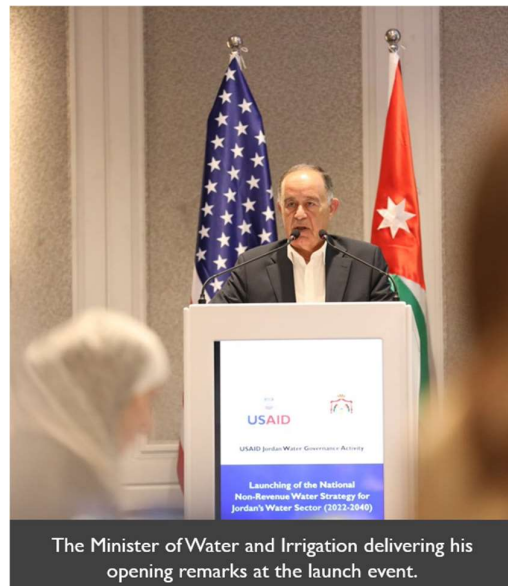
The Minister of Water and Irrigation delivering his opening remarks at the launch event.