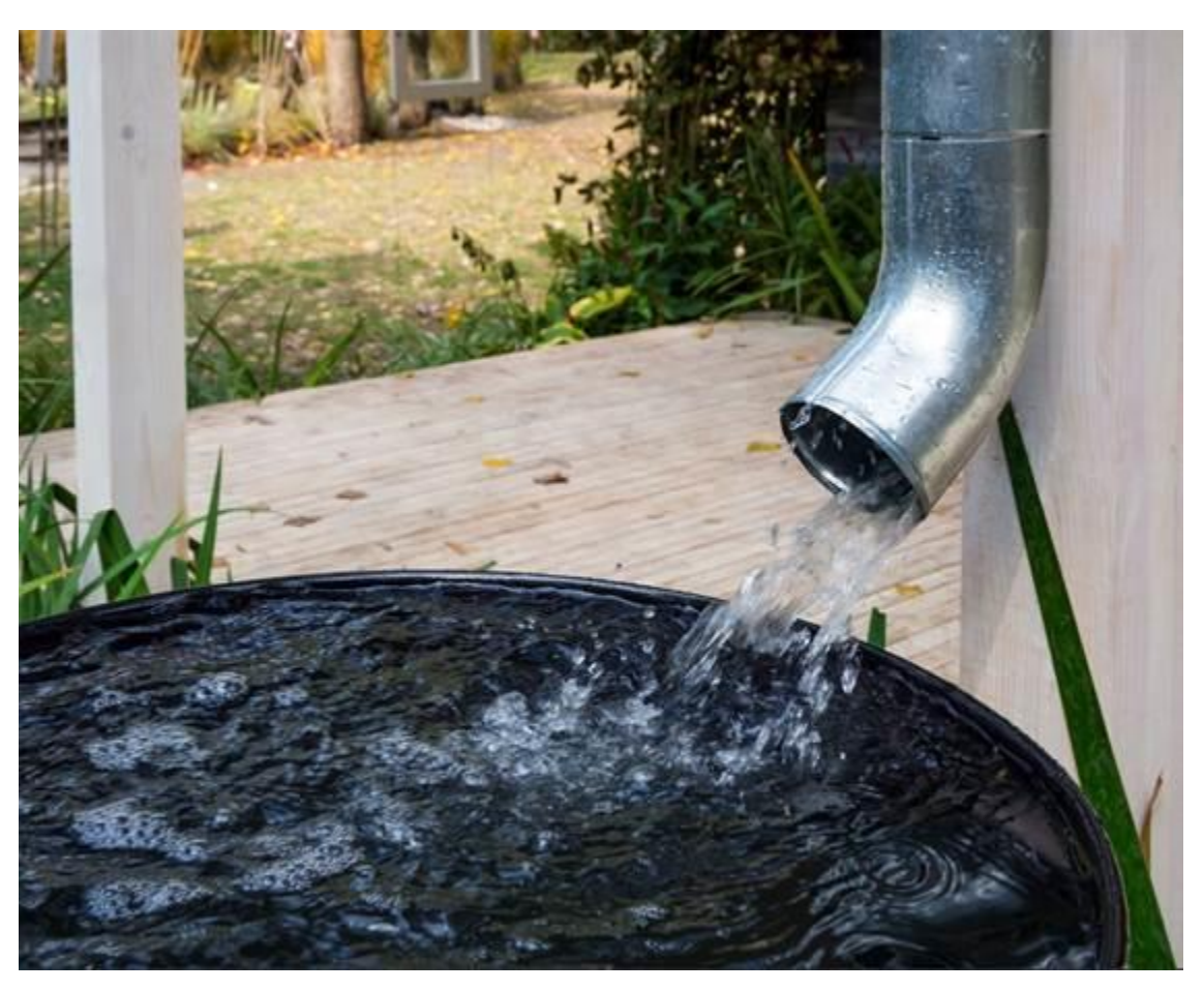
Distributed Rainwater Harvesting Guide

USAID Water Governance Activity (WGA) organized three rainwater harvesting workshops in Madaba, Tafileh, and Karak. USAID WGA updated and printed the Rainwater Harvesting Guide for Governorates and handed copies to the Ministry of Water and Irrigation. Future rainwater harvesting workshops will be held in four governorates (Balqa, Irbid, Ajloun, and Jerash).