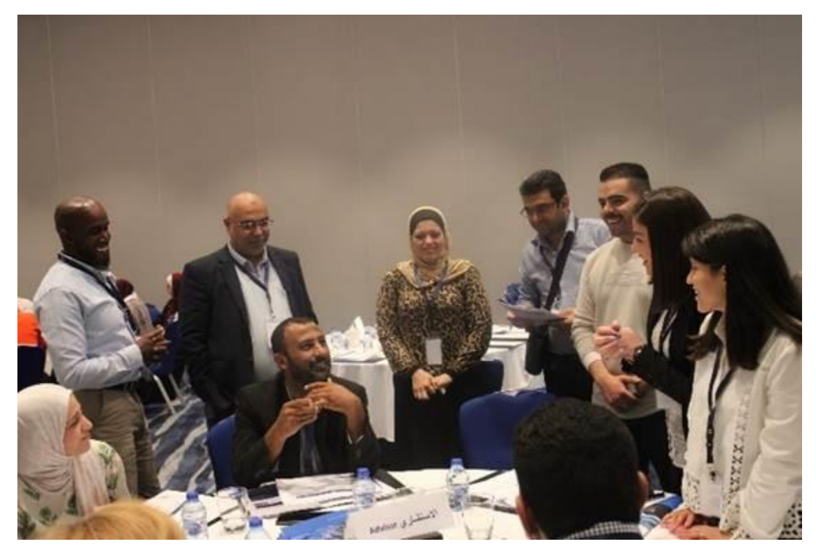
Mentoring Skills Training for the Mentors in the National Water Internship Program

Five non-revenue water (NRW) training topics were introduced by USAID Water Governance Activity in December 2022 to build the capacity of NRW-relevant staff in the sector's entities. 75 sector employees received theoretical and practical training in the areas of physical loss reduction, water distribution certification, and water networking maintenance certification.