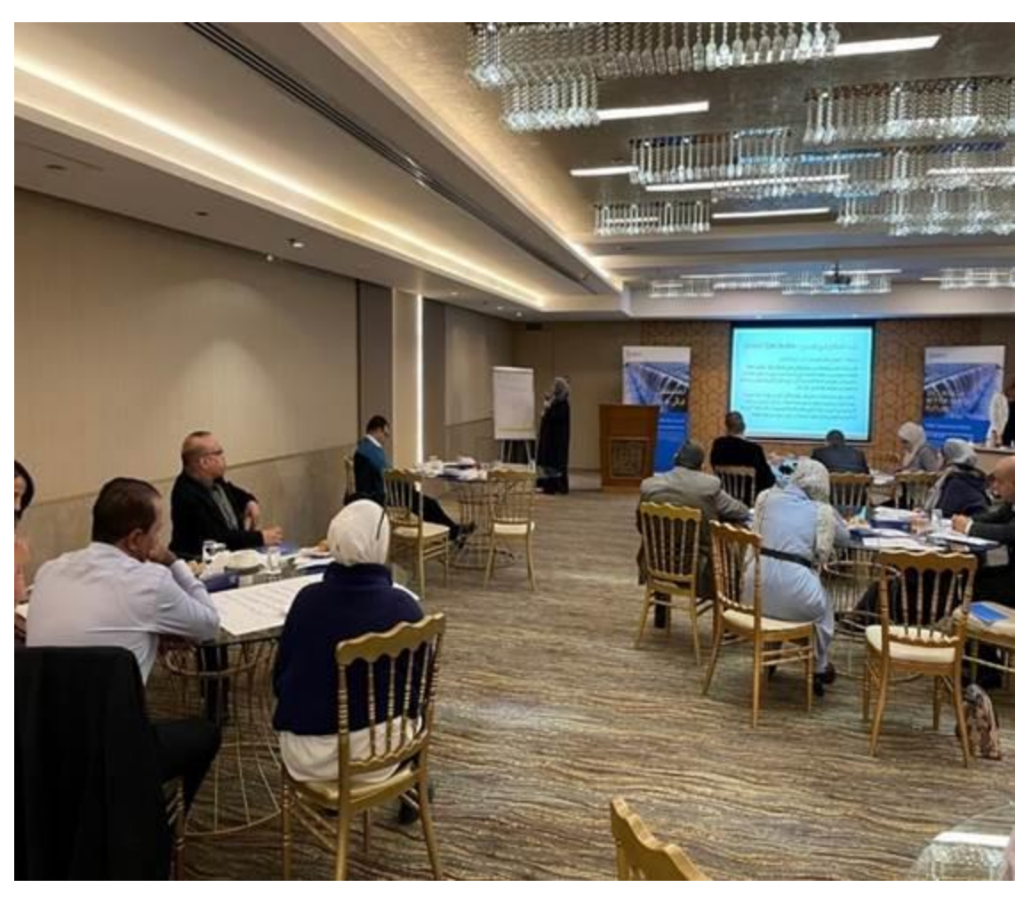
Spotlight on Women Empowerment

The USAID Water Governance Activity facilitated several initiatives aimed at promoting gender mainstreaming in the sector in November 2022. One notable activity was the "Gender Sensitive Budgeting Principles Training" targeting financial and strategic planning teams, human resources management, and institutional development in the water sector. The training concluded with techniques for determining gender equality and social inclusion (GESI) allocations in annual budgets and examining case studies from the latest water sector budgets. The Gender Unit in the Ministry will continue to work to improve gender equality by implementing a gender policy in the water sector in all departments.