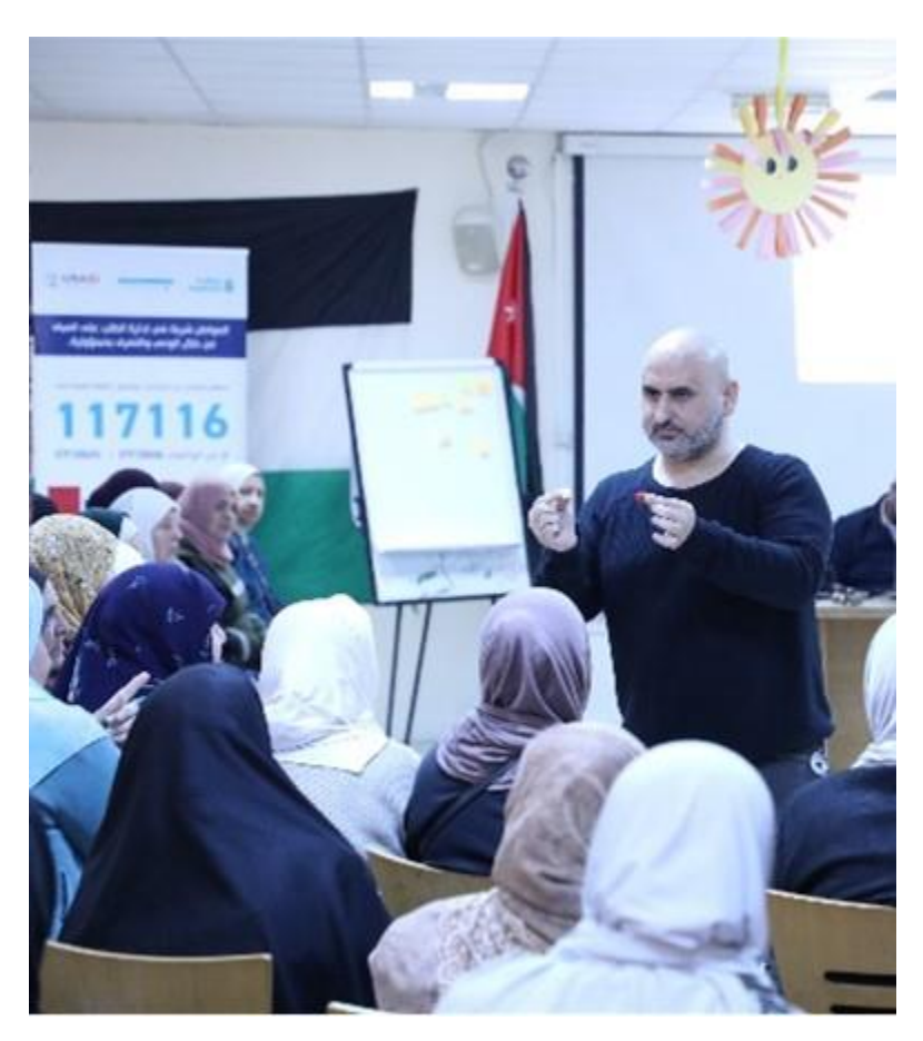
NRW Reduction Citizen Outreach Kickoff

Beginning on December 6, 2022, USAID Water Governance Activity (WGA) assisted utilities in holding community outreach events to spread the word about reducing non-revenue water (NRW). The seminars, organized by Miyahuna, are intended to inform the public about Jordan's water situation, provide advice on improving home water use efficiency, and inspire community members to become change agents in lowering NRW by adopting behaviors like reporting leaks/thefts. The water utilities will continue to benefit from the technical expertise provided by USAID WGA as they create and implement specialized communications strategies aimed at NRW reduction efforts.