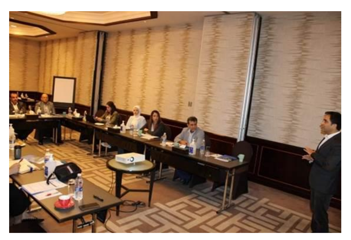
Increasing Public Knowledge of the Updated National Water Strategy

members, and representatives from other universities and international organizations attended the session.