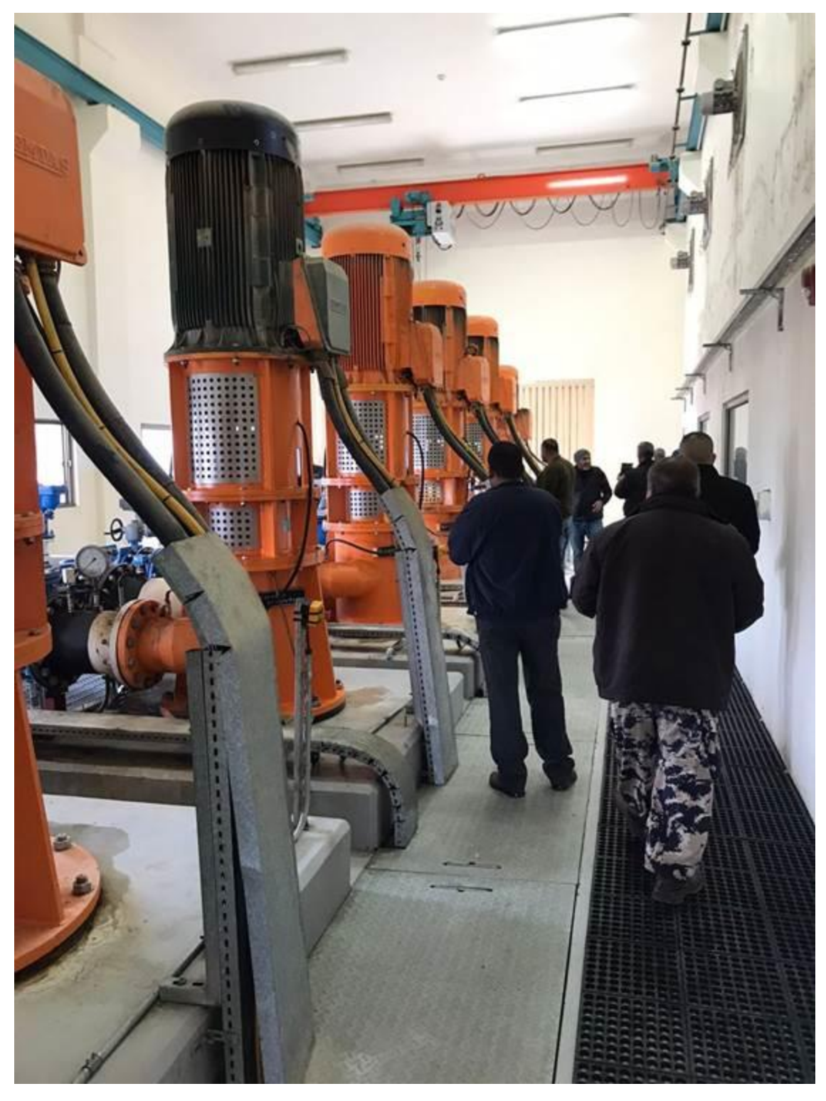
Training on the work and maintenance of pumps and pipes

NRW Certification and Training Programs Launched